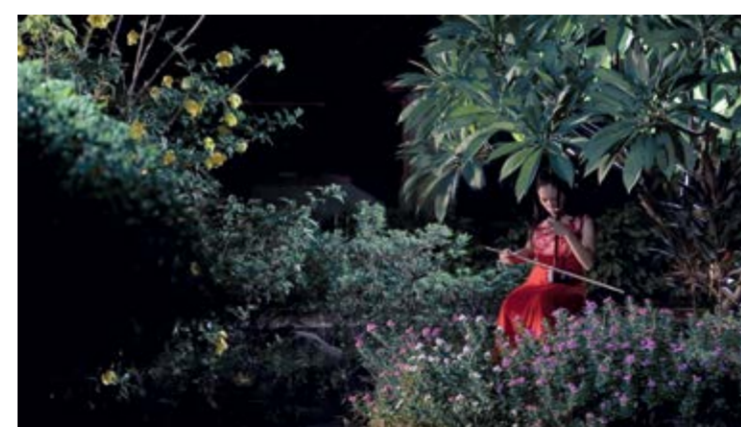
José Drummond (Portugal) Love is the Scariest Thing of All , 2014 Video, 9 minutes