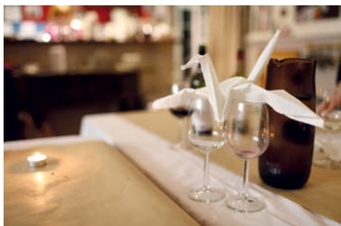
Honi Ryan (Australia) & Abi Tariq (Pakistan) Notes on Not-Knowing , 2014 Performance