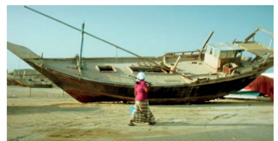
Omar Shoukri (Germany) The Water in Ourselves , 2015 Video, 18 minutes