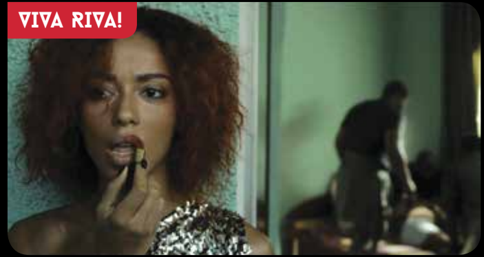
■ Democratic Republic of the Congo