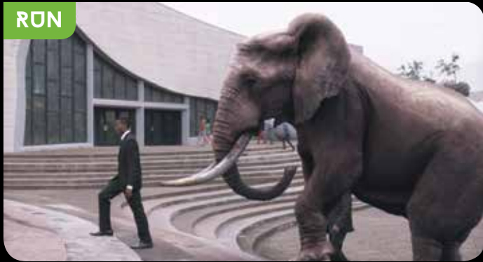
■ Côte d'Ivoire