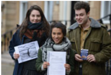
The Doing Group