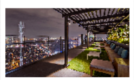
FAT + DRINK