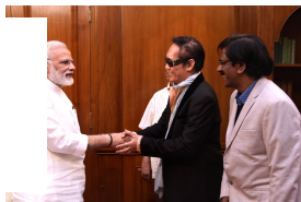
India declares a Filipino as 'King of Visual Poetry'