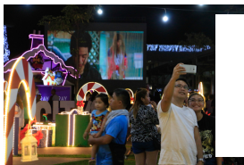
LOOK: Open Air Cinema spreads glee, 'kilig' in Cavite