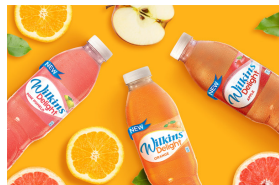
Wilkins Delight insists: 'I am not juice!'