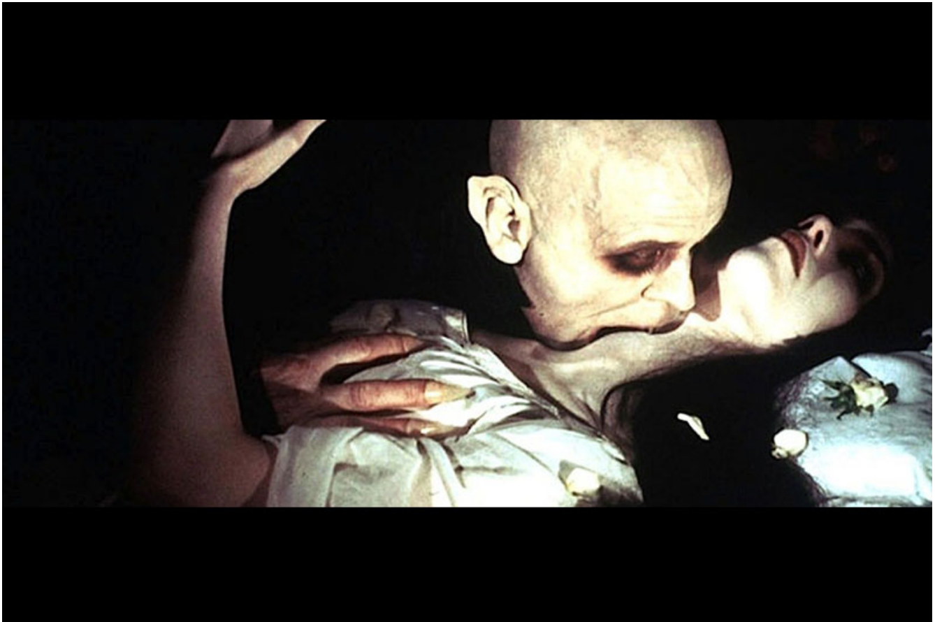
Klaus Kinski puts the bite on Isabelle Adjani in Nosferatu , showing tonight, 6 p.m., at Goethe Institute's "Werner Herzog Retrospective."

MANILA, Philippines - While filming Aguirre, the Wrath of God in the Peruvian forests in 1972, German director Werner Herzog got into such heated encounters with star Klaus Kinski that he ended up threatening to shoot the actor with a gun if he walked off the set. (The film's look and tone — and perhaps the frenzy on set — were later a major inspiration for Francis Ford Coppola while filming Apocalypse Now .)