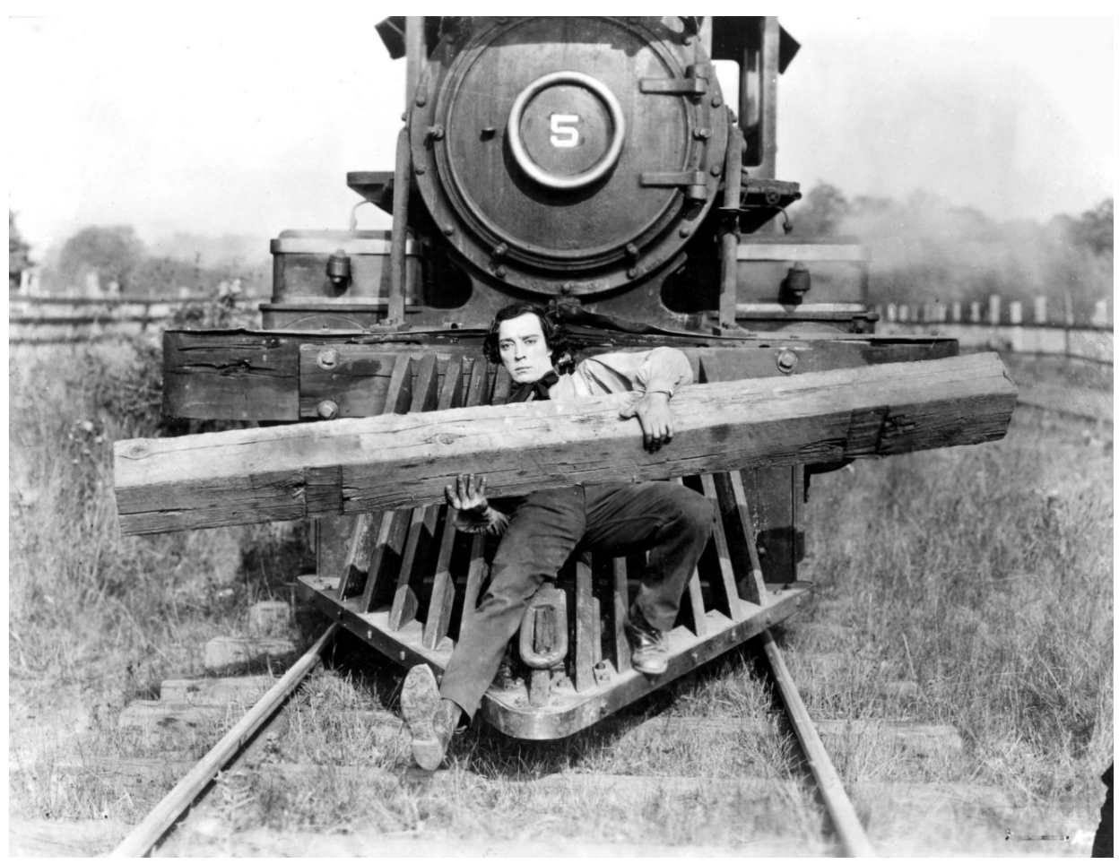
THE GENERAL (1926). Co-directed by Clyde Bruckman and Buster Keaton

Closing the festival at 8:00PM will be the U.S. Embassy's screening of one of the most-revered comedies of the silent era, The General (1926). Co-directed by Clyde Bruckman and Buster Keaton, the film also stars the iconic Keaton as an ill-fated railroad engineer. The film will be scored by a band of veteran musicians — exponents of Motown, Stax, Funk, Blues and Soul – the Flippin Soul Stompers.