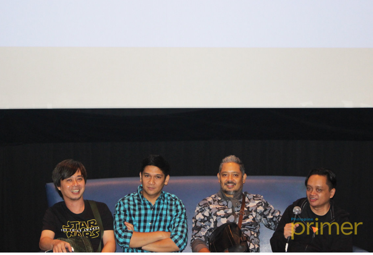
Filipino Rock Band, Rivermaya

The 11th International Silent Film Festival is made possible in partnership with Shangri-La Plaza, Para sa Sining , the National Film Center of The Museum of Modern Art of Tokyo, the Embassies of Italy, Japan, and Spain, Filmoteca de España, Institut Français, JEC Philippines and Marks & Spencer London. All screenings will be open to the public on a first come, first served basis. Watch and listen as we score the silents again!