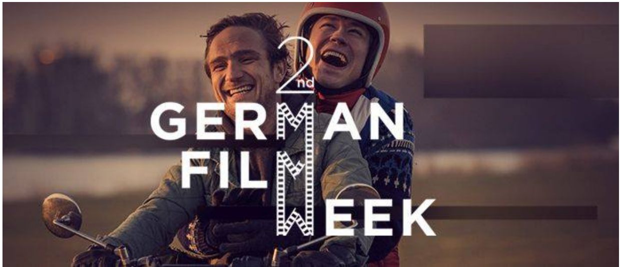
The German Film Week - Manila is now in its second year.

There will be 12 German feature films, plus a film by Filipino filmmaker Brillante Mendoza from Berlinale (Berlin International Film Festival), for film buffs to check out. All of the 12 films were shown in German cinemas in 2016 and 2017.