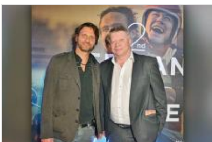
( http://www.sunstar.com.ph/sites )