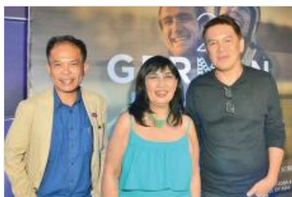
( http://www.sunstar.com.ph/sites )

A CAREFULLY-SELECTED lineup of contemporary German Cinema, many of which are already receiving numerous awards in international film festivals, highlights the 2017 German Film at the SM Supermalls.