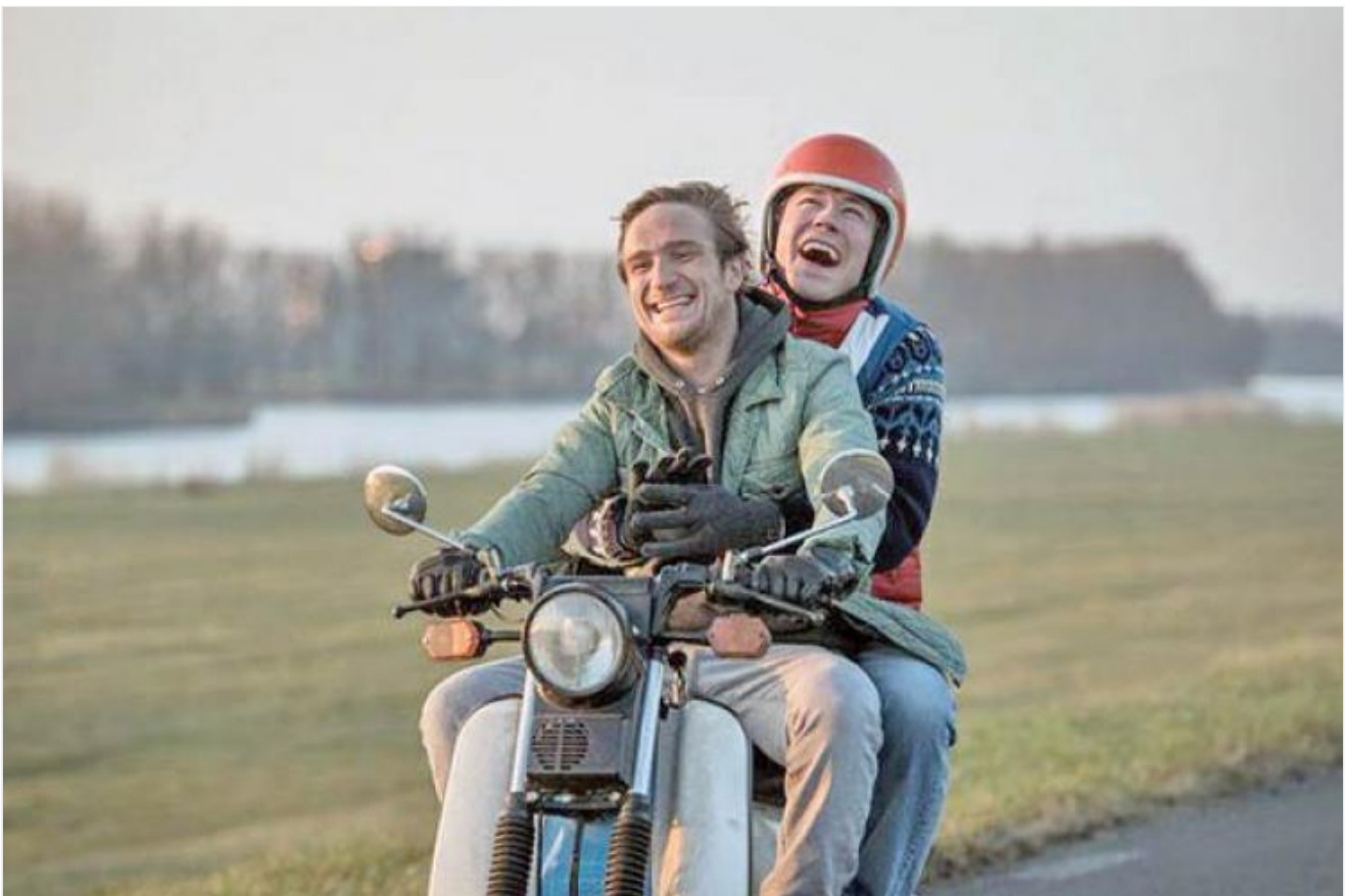
( http://www.sunstar.com.ph/sites/default/files/field/image/article/german_cinema_1_0.jpg )