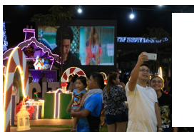
LOOK: Open Air Cinema spreads glee, 'kilig' in Cavite