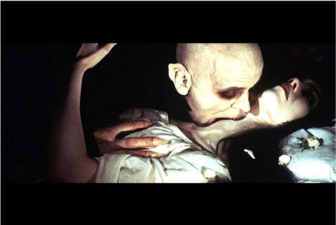
Klaus Kinski puts the bite on Isabelle Adjani in Nosferatu , showing tonight, 6 p.m., at Goethe Institute's "Werner Herzog Retrospective."

MANILA, Philippines - While filming Aguirre, the Wrath of God in the Peruvian forests in 1972, German director Werner Herzog got into such heated encounters with star Klaus Kinski that he ended up threatening to shoot the actor with a gun if he walked off the set. (The film's look and tone — and perhaps the frenzy on set — were later a major inspiration for Francis Ford Coppola while filming Apocalypse Now .)