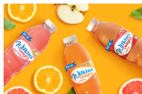
Wilkins Delight insists: 'I am not juice!'