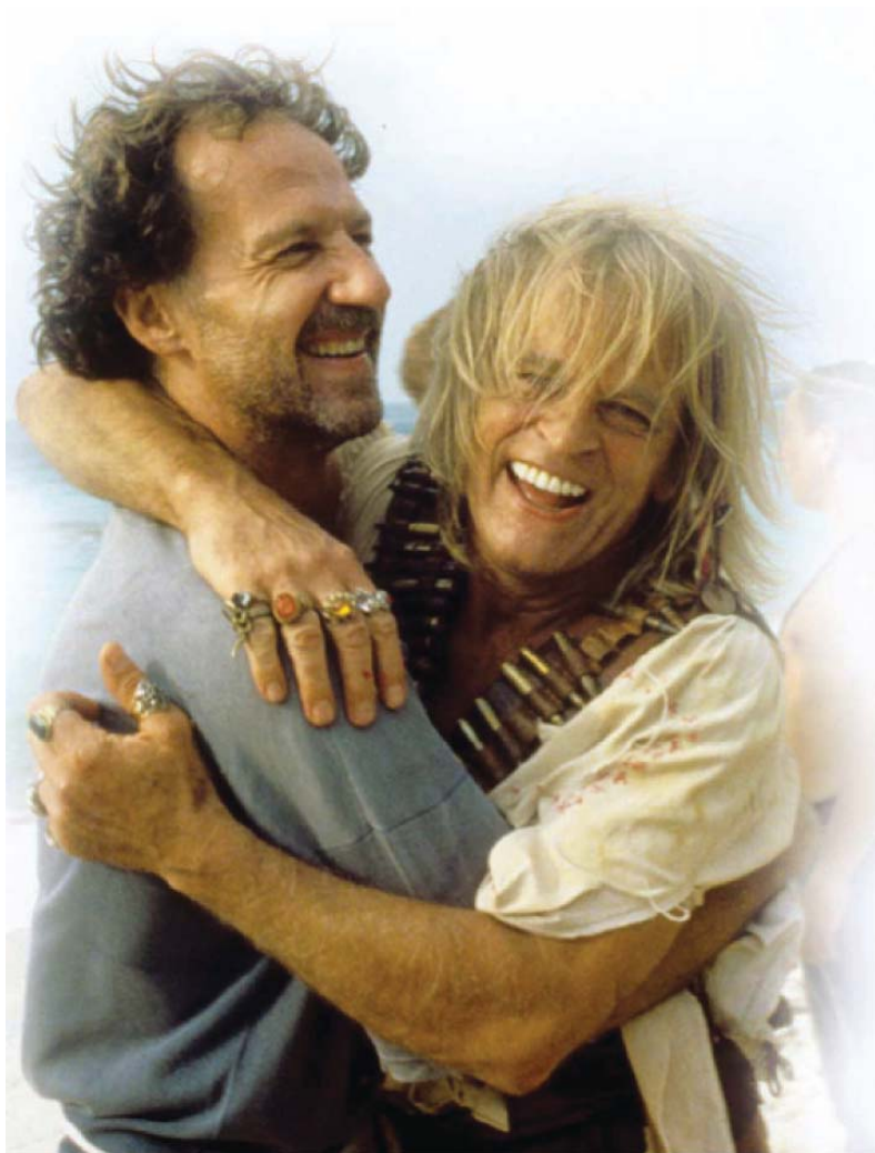
Werner Herzog and Klaus Kinski

Cobra Verde took hold of a garrison, Fort Elmina, improved the place and lived there managing the slaves with Taparica (King Ampaw). The slave trade across the Atlantic and Brazil was their route.