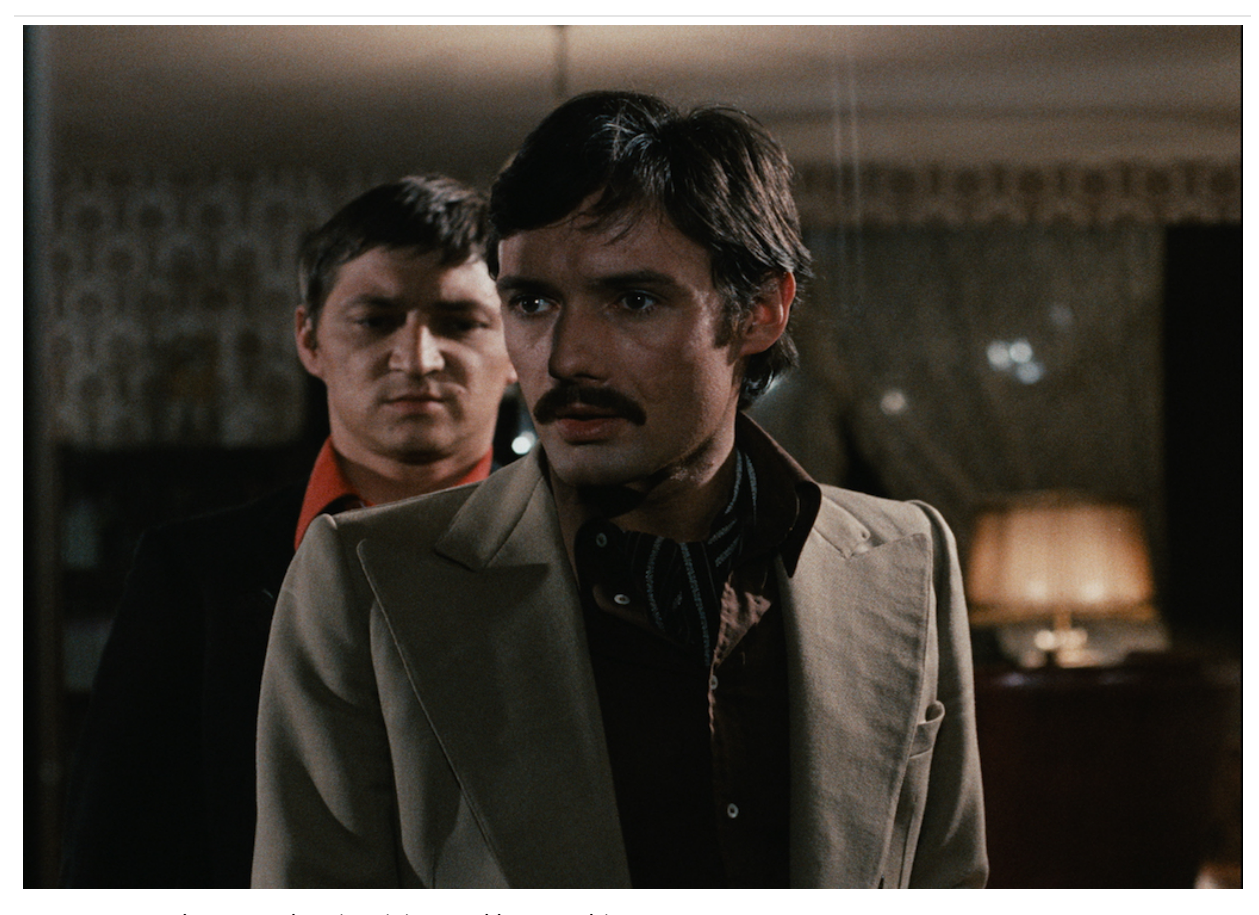
_ Faustrecht Der Freiheit (1974) (Fox and his Friends)