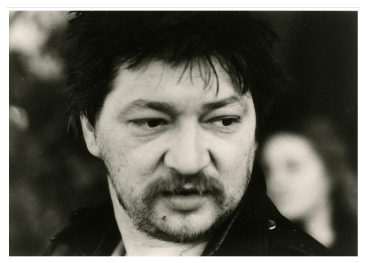
Rainer Werner Fassbinder

Fassbinder is one of the most prominent figures in the New German Cinema movement and garnered a worldwide reputation for his intriguing motion pictures. Although the auteur had a short lived film career that only lasted 16 years (Fassbinder died of overdose in 1982), his active years resulted to a legacy of 39 films, 6 made for television movies, 3 short films, 4 video productions, 24 stage plays and 4 radio plays. He is often cited as a great influence of post-war period German filmmaking.