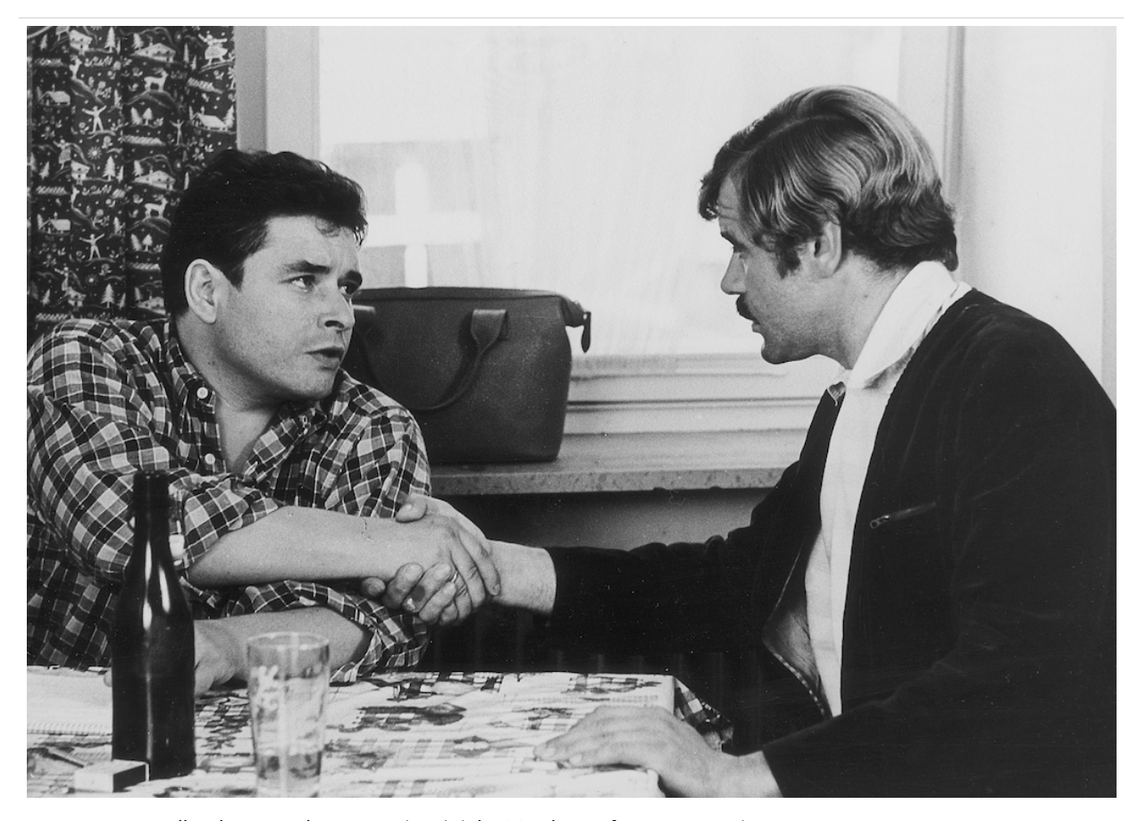
Der Händler der vier Jahreszeiten (1971) (The Marchant of Four Seasons)