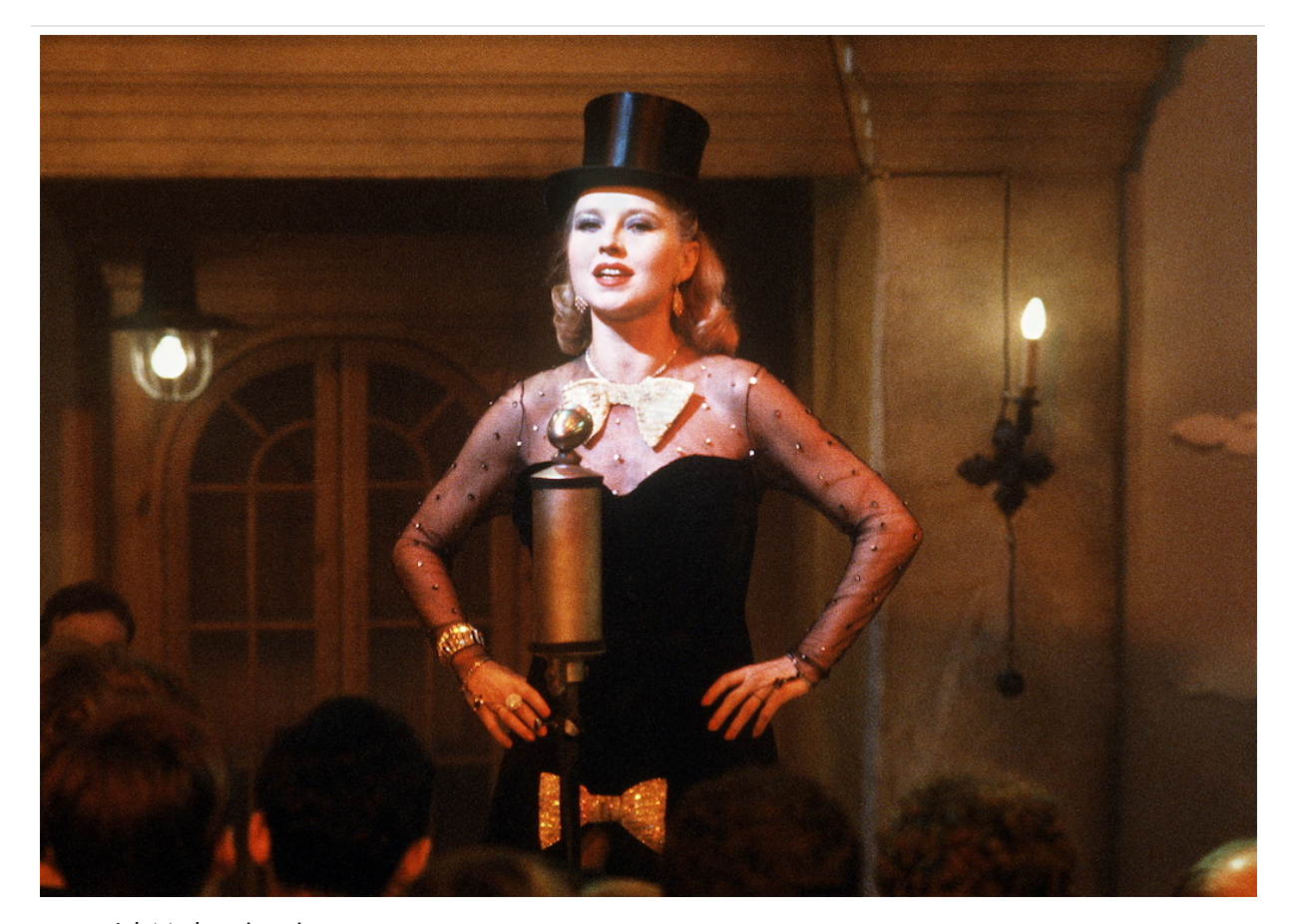
_ Lili Marleen (1980)