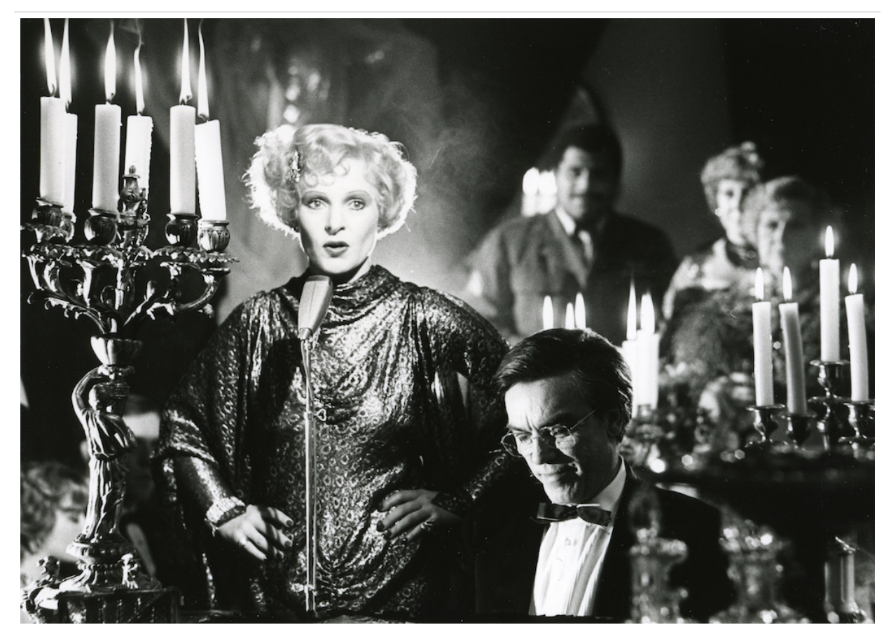
Die Sehnsucht Der Veronika Voss (1981) (Veronika Voss)