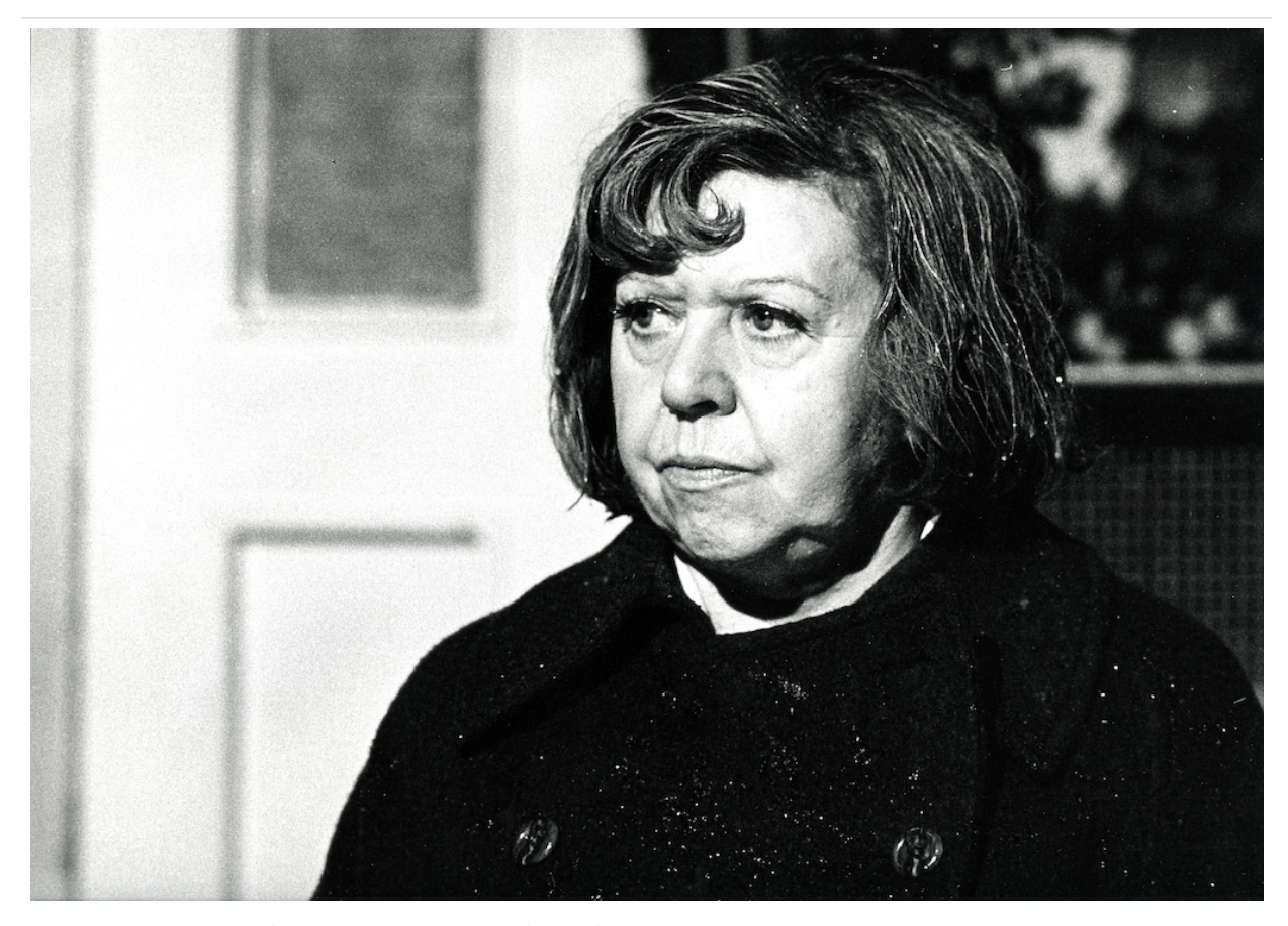
Angst essen Seele auf (1983) (Fear Eats the Soul)

which, in an intriguingly ambivalent way, she seems to relish.