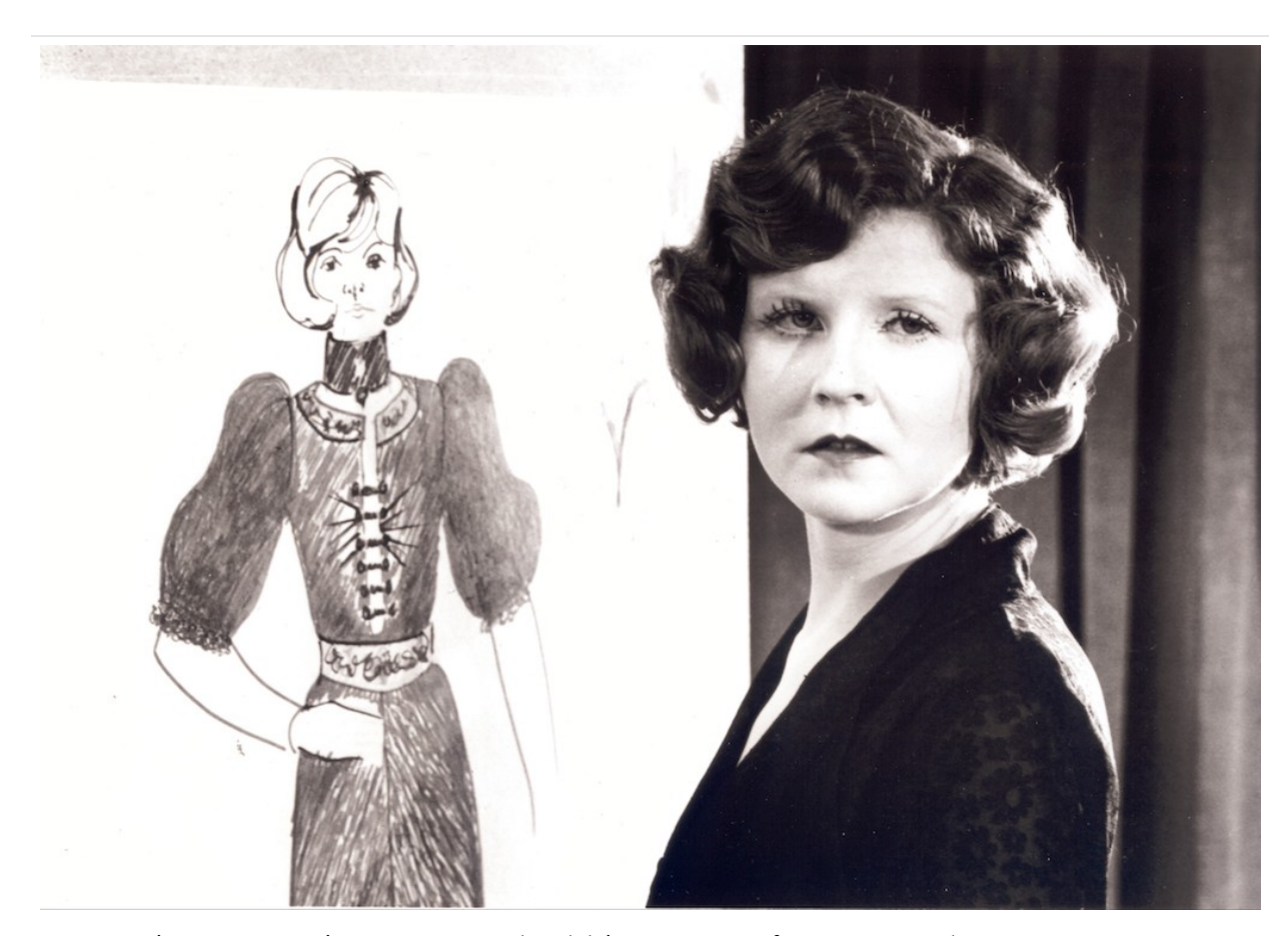
Die bitteren Tränen der Petra von Kant (1972) (The Bitter Tears of Petran von Kant)