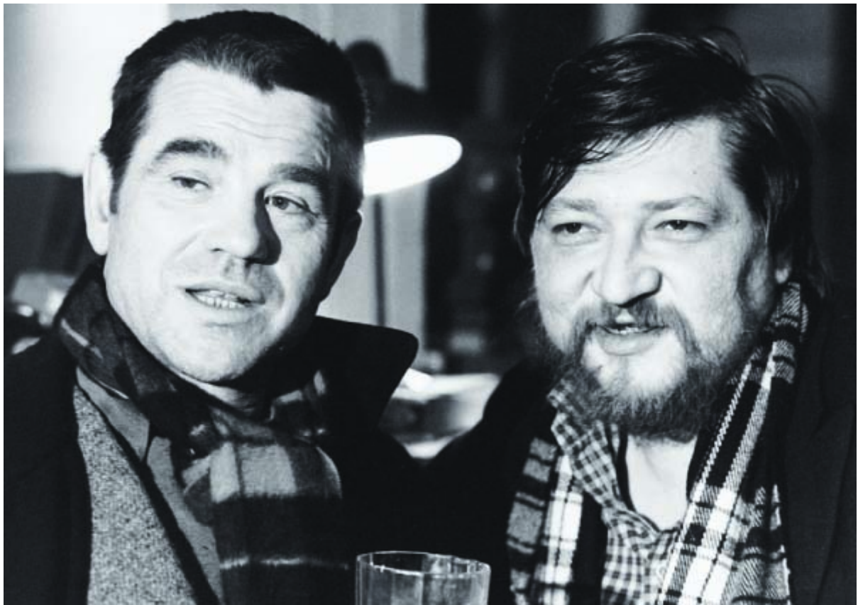
Rainer Werner Fassbinder and Hilmar Thate in Die Sehnsucht der Veronika Voss (1982)