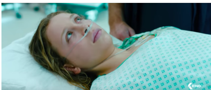
Screenshot from YouTube.com

But through her recklessness, she meets the stubborn and unruly horse "Rock My Heart." And surprisingly, the two strike up an unusual friendship. This later leads the horse's owner Paul Brenner to recruit Jana to be the Rock My Heart's jockey in an upcoming race.