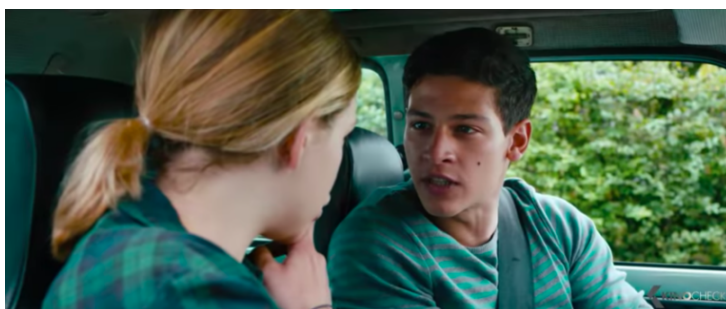
Screenshot from YouTube.com