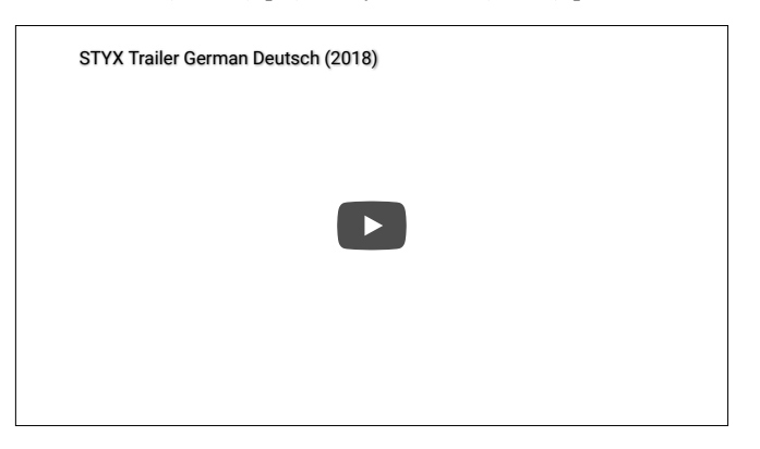
A successful doctor sets out to fulfill her long-cherished dream of sailing from Gibraltar to the island of Ascencion. However, she spots an over loaded and sinking boat full of refugees in the Atlantic. She calls for help from the authorities and is advised to stay away from the

SM Aura Premier, Nov. 10, 7pm; SM City North EDSA, Nov. 9, 7pm