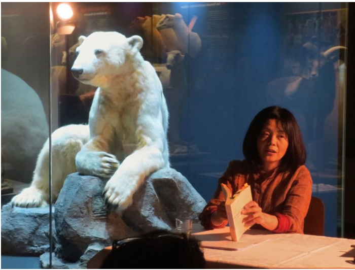
Yoko Tawada during a reading in front of the sculpture of Knut at Berlin's natural-history museum.

We're doing a Bibliophibians Reading Group for her novel, Memoirs of A Polar Bear , beginning on Monday, July 2. You can join the discussion by posting in Comments.