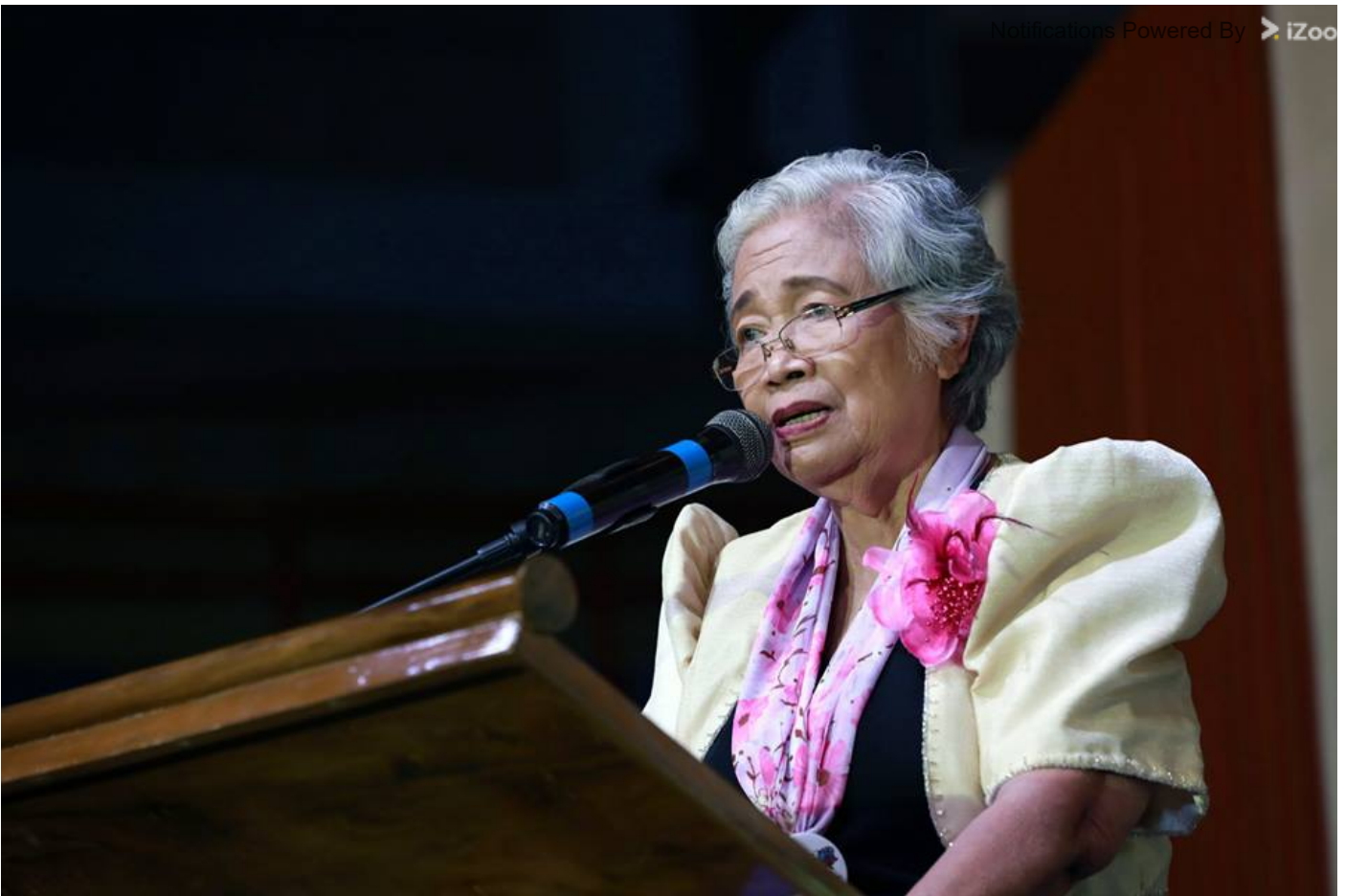
Education Secretary Leonor Briones

Education Secretary Leonor Briones met with Spanish Ambassador to the Philippines Jorge Moragas in a courtesy call last August to “renew ties for the promotion and teaching of Spanish language and culture in the Philippines.”