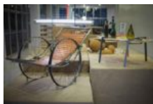
'Pure Gold' is a travelin

This initiative of IFA is an exhibition with the theme of upcycling — the re-use of raw materials that have already been processed to create new objects of greater value — which aims to raise awareness of alternative production techniques, while simultaneously pointing