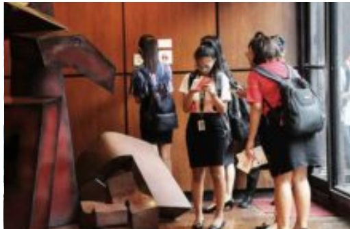
A DIY tour of the arts