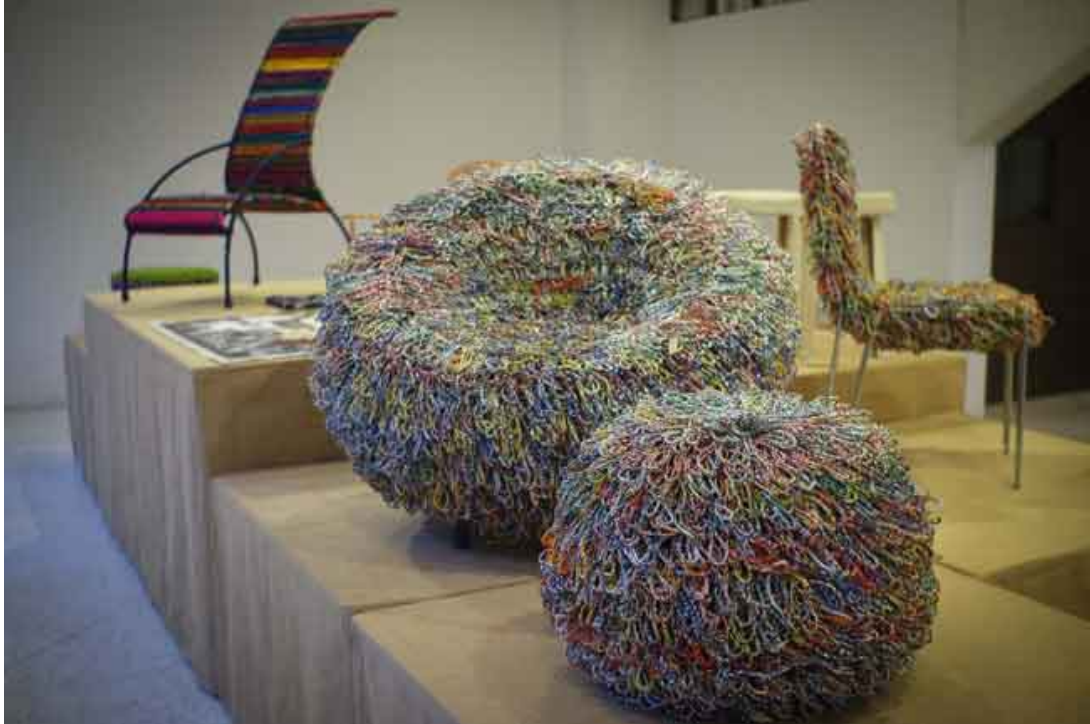
The exhibit is composed of 76 pieces by 53 designers from 7 regions.

By The Manila Times · November 3, 2019 The Goethe-Institut in partnership with IFA (Institut für Auslandsbeziehungen, the German institute for international relations) and the Vargas Museum presents “Pure Gold — Upcycled! Upcycled!” an exhibition that highlights recycling and upcycling in design.