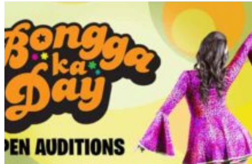
'Bongga Ka Day' begins casting