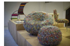
The exhibit is composed of 76 pieces by 53 designers from 7 regions.