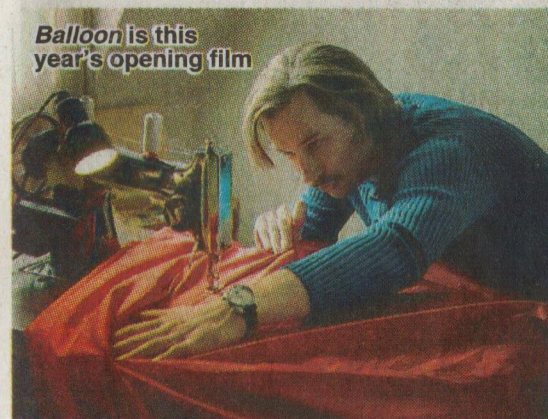
Balloon is this year's opening film