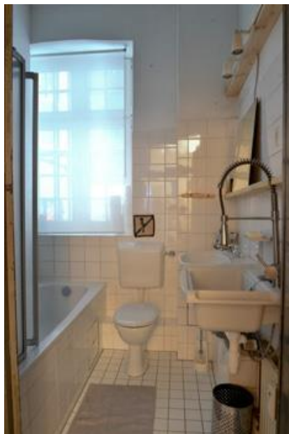
Bathroom (joint use)