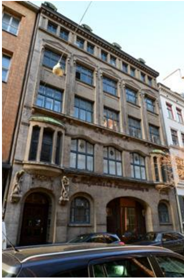
The Street | The Entrance | Eastside