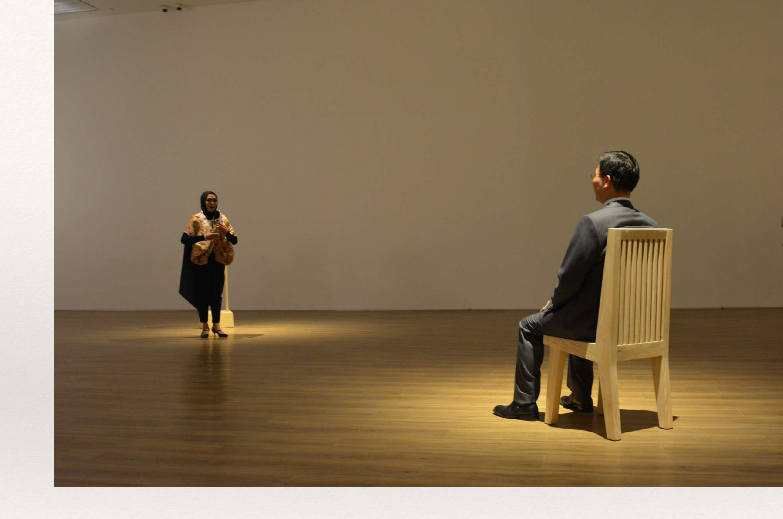
MACAN, a disruption