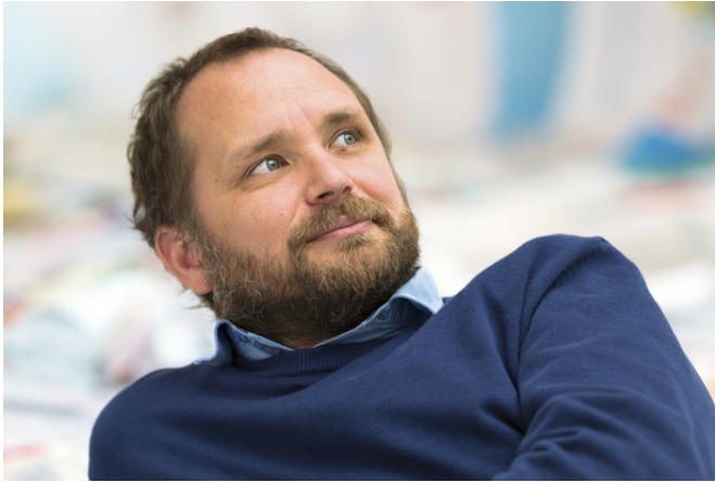
Tomás Saraceno.

Tomás Saraceno's practice is informed by concepts linking art, life science, and the social sciences. Enmeshed in the junction of these worlds, his floating sculptures, community projects, and immersive installations propose sensory solidarity with the planet through a social, mental, and environmental ecology of practice.