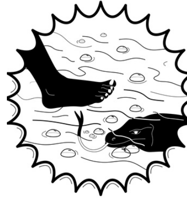
Logo Monitor Lizard House

In response to the work of Tomás Saraceno, Aerocene Explorer, Monitor Lizard House will devise sensing and visualization methods for the climate crisis that is eroding the coastal area in Southern Bangkok – Samut Prakhan.