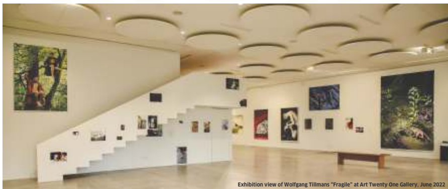
Exhibition view of Wolfgang Tillmans "Fragile" at Art Twenty One Gallery, June 2022

In 2023, the programs department of the Goethe-Institut Nigeria continues its yearly projects Support and Connect Initiative and the Berlin-Lagos Residency program with their 8th and 4th consecutive year running. We make Books, The Art/Space Negotiations: Lagos , and New Visions, Reel Stories will have their second-year features while new projects like Election Talks (in retrospect of the coming elections in Nigeria) and Dreaming New Worlds (a series of discursive platforms on future innovations) gets their debut features. And, yeah! It is the year of the biennial and Goethe-Institut Nigeria will collaborate with other stakeholders. And, in partnership with other EUNIC members, we will be supporting regional projects from the international scene.