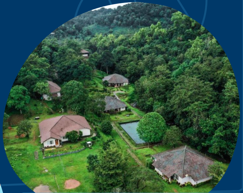
Resort Abad Brookside Lakkidi