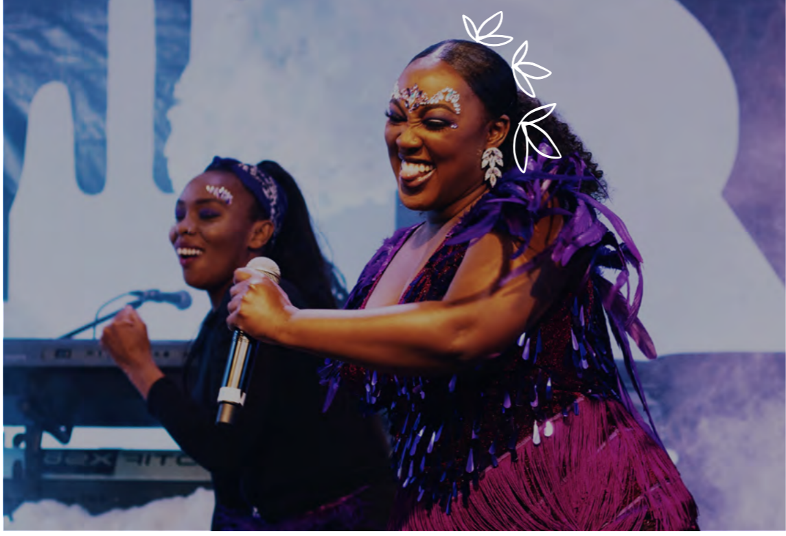
Participants of the perFORM Music Incubator

The perFORM Music Incubator is the place to be for: musicians, artist managers, music publicists, music producers, event producers, sound & light engineers