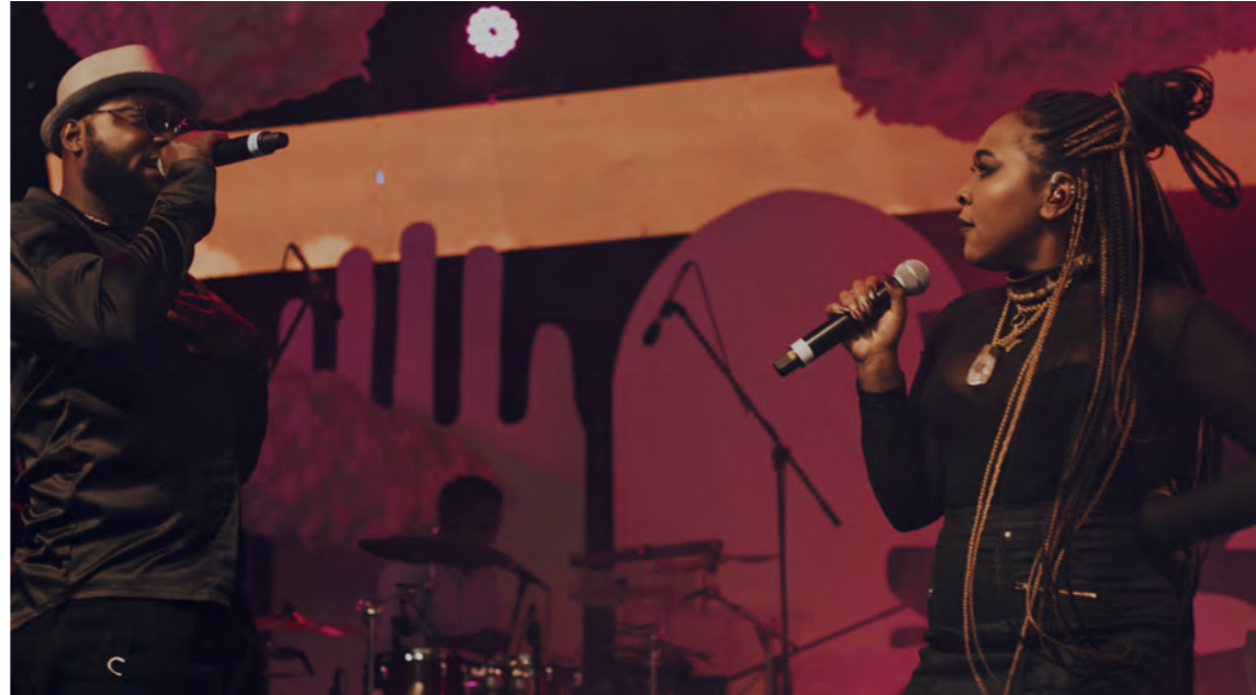
Participants of the perFORM Music Incubator