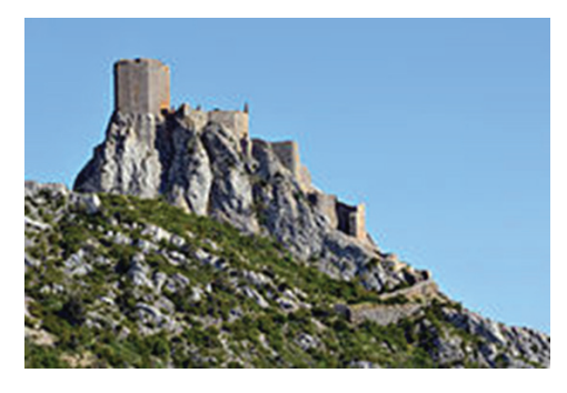
Le château de Quéribus

In the South of France, inland from the Mediterranean, and near the Pyrenees (the modern border with Spain) is a region of remarkable castles and historic sites such as le château de Quéribus , and the city of Carcassonne . Many of the place names are famous – how are they pronounced?