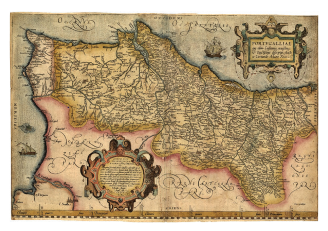
In Public Domain <u>File:Portugalliae 1561 (Baseado no primeiro mapa de Portugal)-JM.</u> <u>jpg - Wikimedia Commons</u>

Mapa de Portugal: mapa offline e mapa detalhado de Portugal (portugalmap360. com)