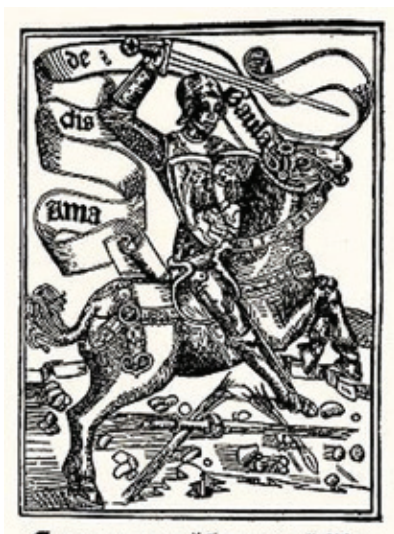
Los quatro libros del Clir tuolo cavallero Amadis de Baula: Lomplidos.

Compare life at that time with modern life, and share your ideas with others.