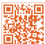
Course Online Registration