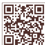
Examination Online Registration