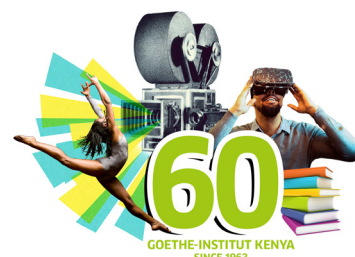
Photo: The launch of the much-anticipated VR section in our library © Vincent Chepkwony

Please also note that our events are public events and that photos will be taken for PR purposes.