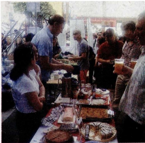
POPULAR German sweets were also available at the fair.

Mabuhay Germany 2015 is organized by the German-Philippines Chamber of Commerce and Industry, in cooperation with the German Embassy, Goethe Institut, and the German European School Manila, to celebrate over 60 years of diplomatic relations between the two countries.