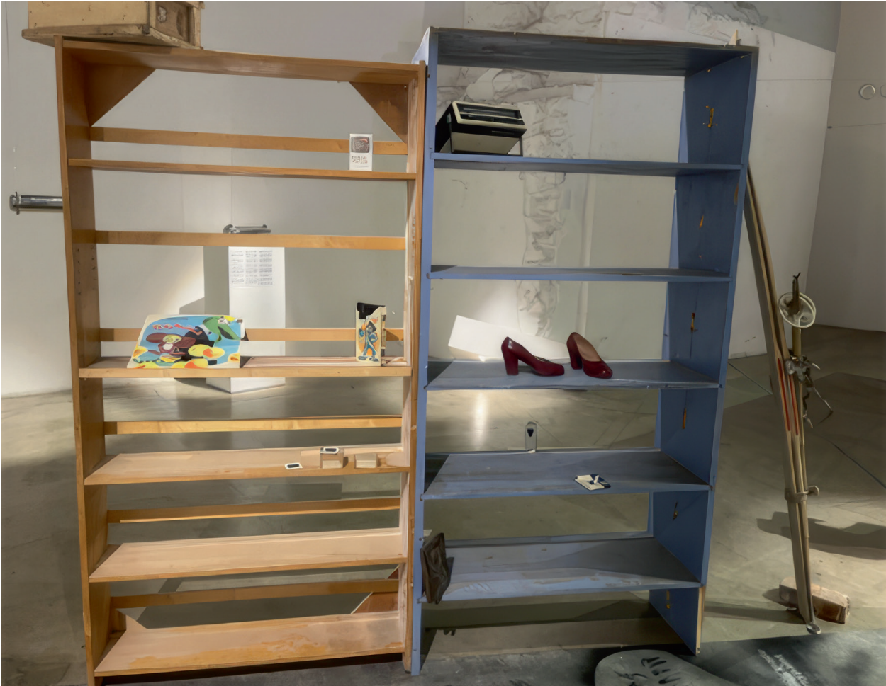
Installation of things found in the cellars of Ida-Virumaa.