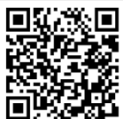
General Terms & Conditions Webshop / Language Courses

Any correction of personal data after registration will incur an administrative fee of INR 2,900 (including GST).