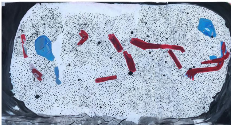
Die for you © Sannad Sharif

The Goethe-Institut supports Sudanese artists in the region by fostering local artistic networks, professional exchange, and sustainable structures of inclusion