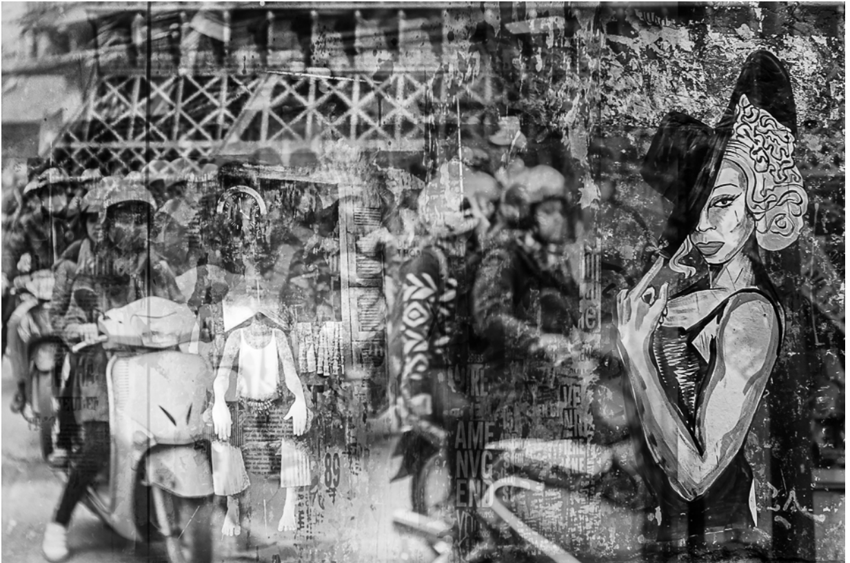
grafitti and traffic