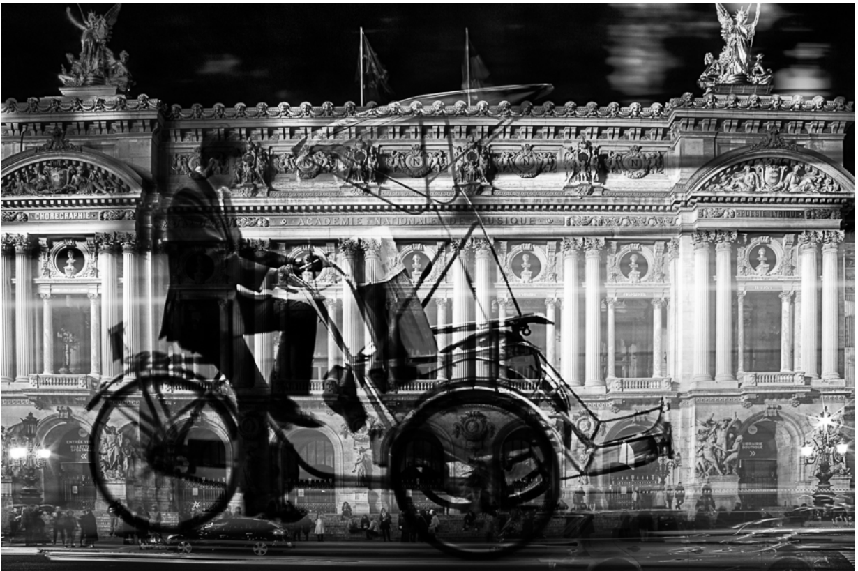
rushing to the Opera