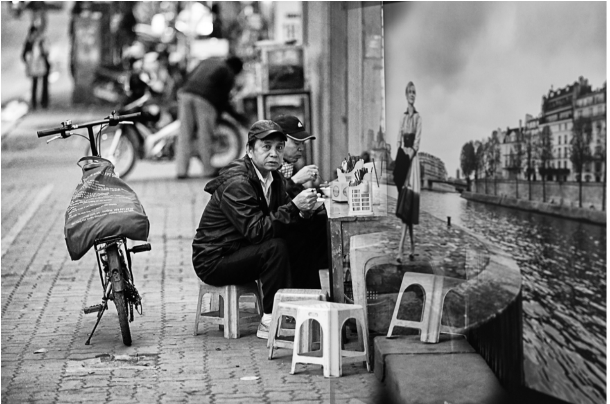
a long the river