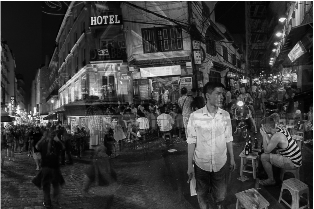
Bia Hoi Corner