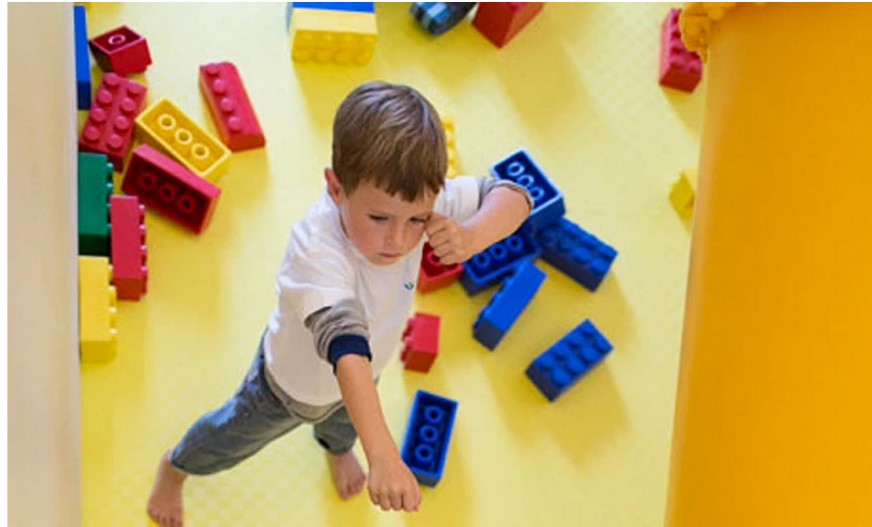
📷 Pupil activities includes drawing, Danish lessons and 'unit of inquiry' periods to stimulate creative thinking.

Toymaker's International School of Billund includes 'innovation studio' for kindergarten kids