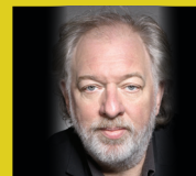
Wolfgang Becker

Thursday, November 3, 7 pm Me and Kaminski (Ich und Kaminski)