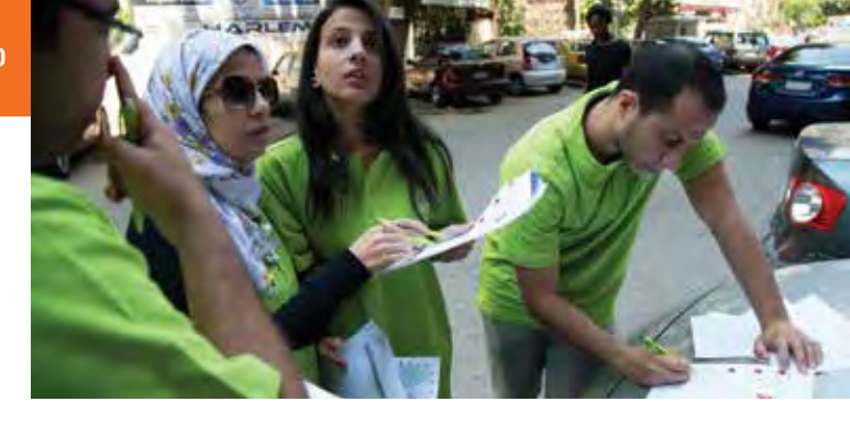
14 October, 6-7 pm, Room 8

BuSSy is a performing arts project that documents and draws on censored and untold stories. These are stories that shed light on how different communities in Egypt see and deal with gender. The project organises workshops and performances that leave the stage to men and women to share their stories. At the Goethe-Institut, BuSSy will be performing a selection of stories from its archive that give insights into the experience of individuals. Afterwards the audience will be invited to share their own experience.