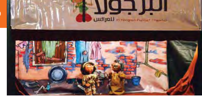
14 October, 1-2 pm, Event Hall PUPPET THEATRE "LA PERGOLA"

Duration: approximately 1 hour, in English